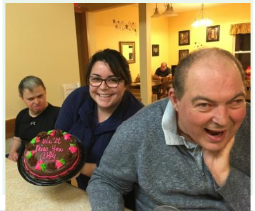
Highland News ~ December 2019