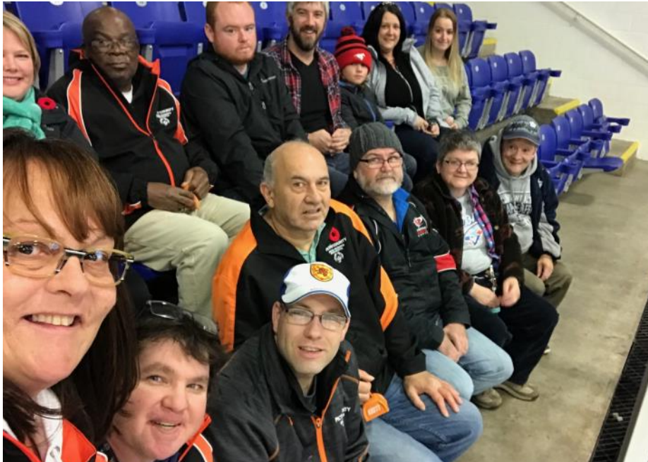
FROM THE EXECUTIVE DIRECTOR

Another year is drawing to a close as we prepare for Christmas 2019. It will be the last Christmas spent at our current office. We will be starting the New Year with a move to our new office in January 2020. In the meantime, plans are well underway for festive meals, visits and parties during the Christmas season.