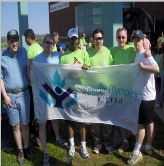
A HAPPY CREW OF OLYMPIANS