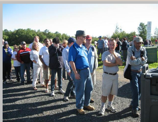
WAITING FOR THE GOOD STUFF