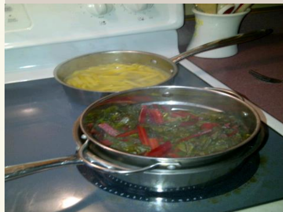
FROM THE GARDEN TO THE STOVE TOP AT VIGGO HOLM ROAD