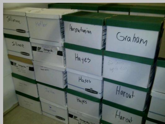
MORE NEAT ROWS OF FILE BOXES