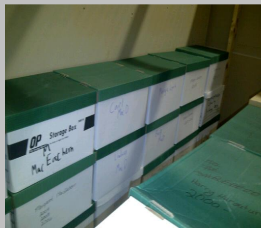
NEAT ROWS OF FILE BOXES

Thank you again to everyone who participated in completing this mammoth task.