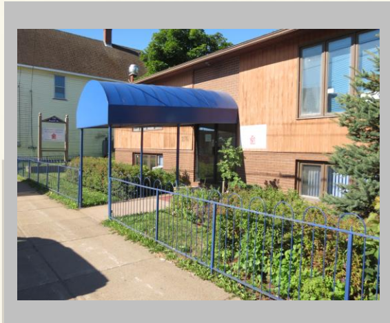
HCRS NEW MAIN OFFICE AT 276 FOORD STREET, STELLARTON.

These beds were available to any group of HCRS participants wanting to have a fresh vegetable garden for the summer and fall months. The shed at Viggo Holm Road has basic gardening tools, a wheel barrow and a watering hose.